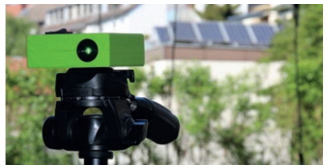
The injection process is permanently monitored using laser-based soil and structure control equipment.

Long service lifetimes; no degradation in the soil